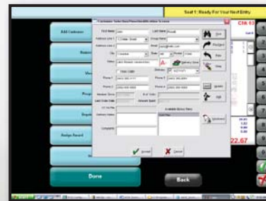
Adding a customer to the guest check is quick and easy